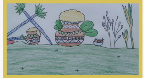
Sashmitha N G5-D