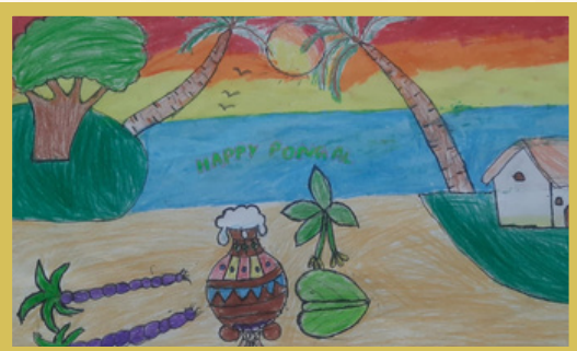
Pranishka k G5-D