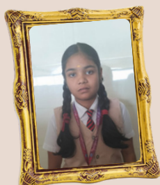
Pradhakshina B G8-D